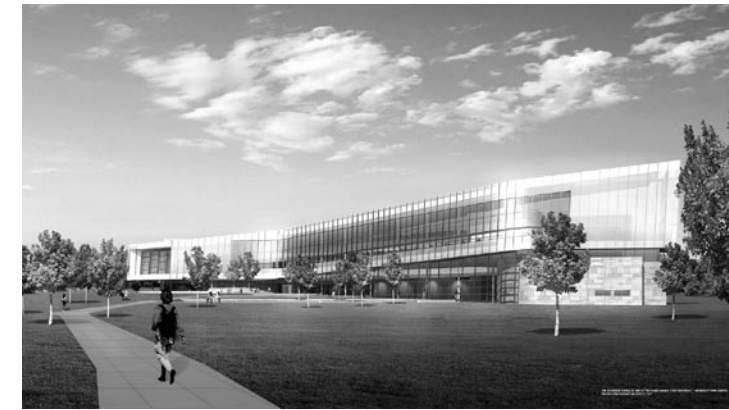
South view of proposed Dickinson School of Law building.

The New York-based firm of Polshek Partnership Architects designed the building, which will meet the guidelines established by the Leadership in Energy and Environmental Design